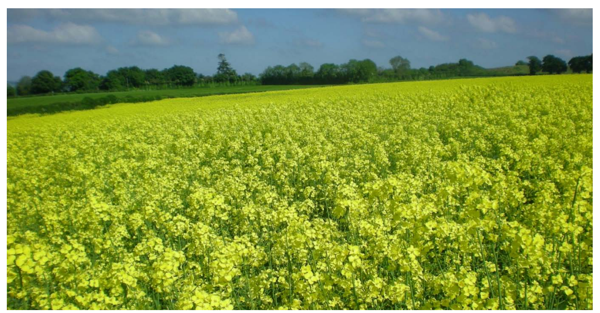
Bioenergy crops: the fuel of the future? Understanding the development, use and impacts of bioenergy requires research by engineers, biologists, economists, political and social scientists. The TCBR can bring together these disciplines to deliver research excellence in this and many other areas.